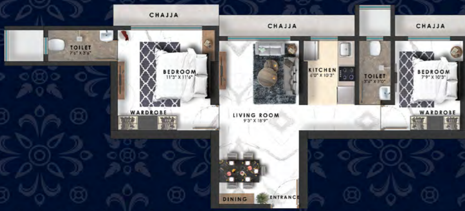
UNIT PLAN 2 BHK | RERA CARPET AREA 532 SQ. FT.