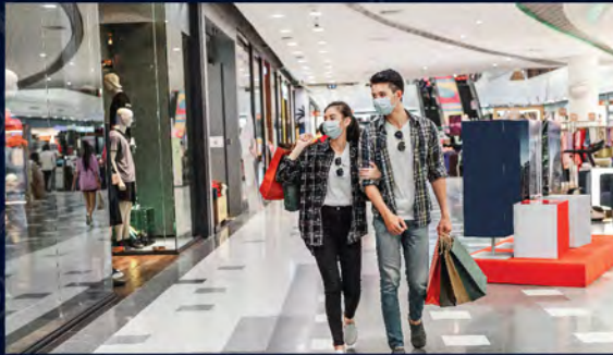
CHOICEST OF LEADING MALLS IN NEIGHBOURHOOD