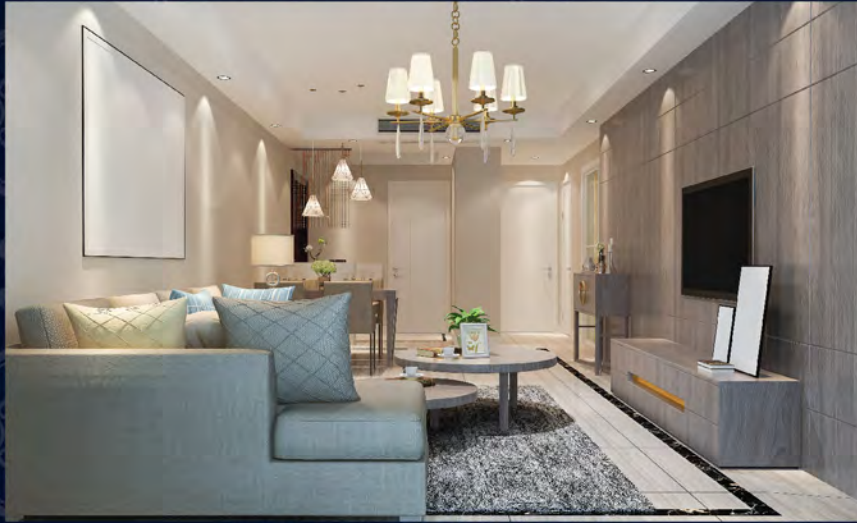
WARM WELCOME SPACE