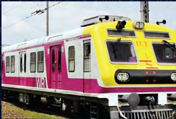
LOCAL RAILWAY STATIONS WITHIN TOUCHING DISTANCE