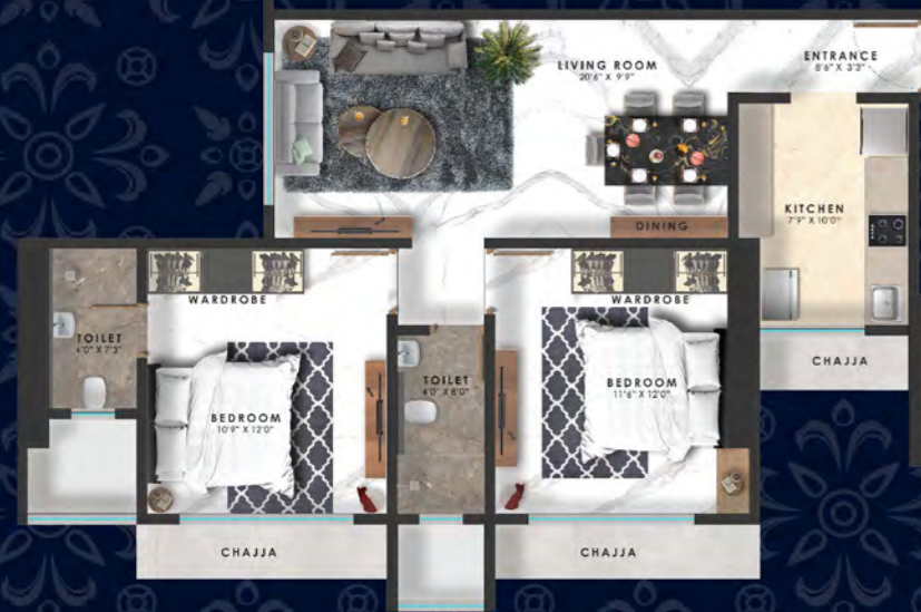
UNIT PLAN 2 BHK | RERA CARPET AREA 682 SQ. FT.