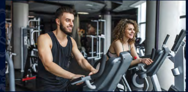
WELL EQUIPPED GYM