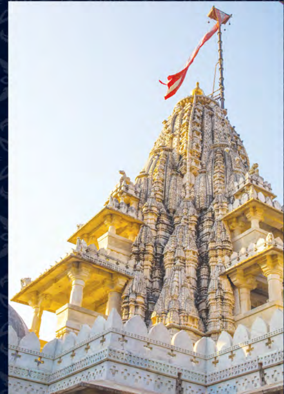
SPIRITUAL PLACES, JAIN TEMPLES, IN NEIGHBOURHOOD