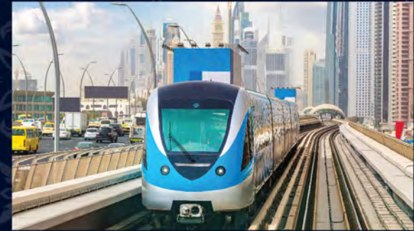
QUICK ACCESS TO METRO STATION