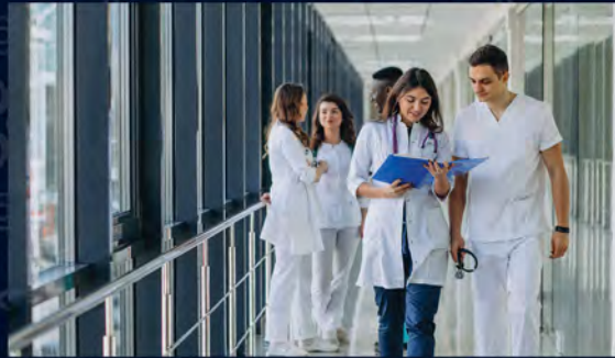
NETWORK OF PROMINENT HOSPITALS