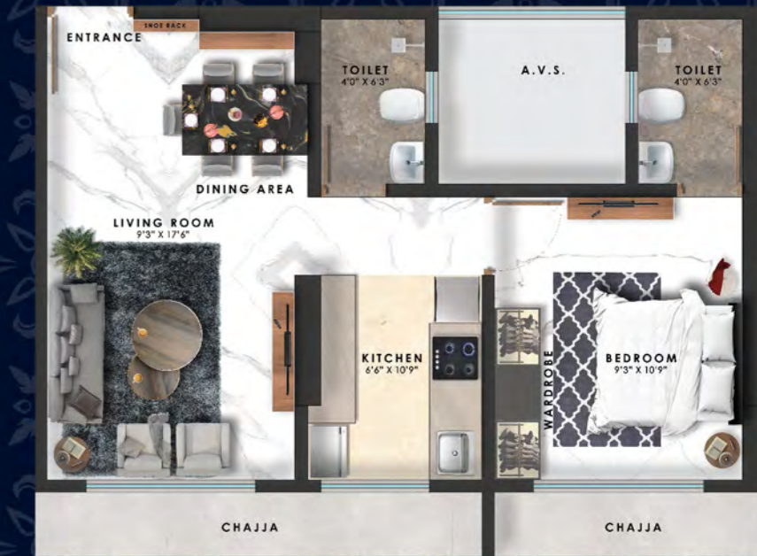
UNIT PLAN 1 BHK | RERA CARPET AREA 404 SQ. FT.