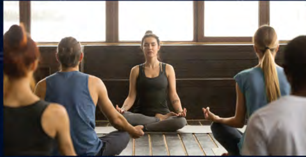
YOGA / MEDITATION ROOM