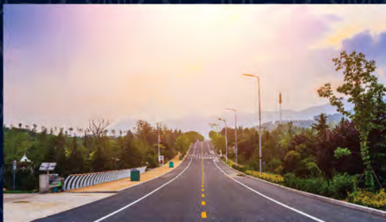
EASY ACCESS TO WEH