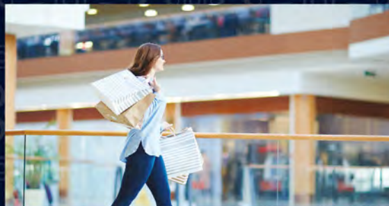
NETWORK OF SUPERMARKETS, BANKS, RESTAURANTS, LIFESTYLE STORES, PLAY ZONES AROUND THE PROJECT